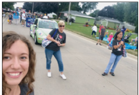
It was a disco fever theme at the Wilton Founder’s Day parade!