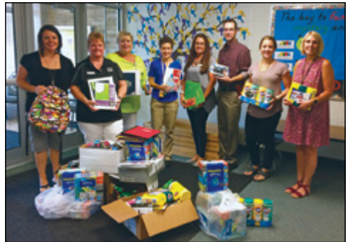
Our branch in Tomah, WI collected the most money and supplies for our School Supplies for Teachers drive! Way to go, Tomah!