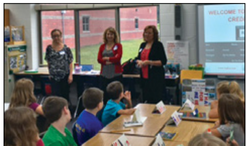
We love teaching financial education classes! If you want us to come teach your class, let us know.