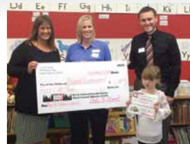
1st Place Durant Elementary School

The winners and schools were each awarded a fifty dollar prize.