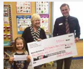
2nd Place Rock Island Center for Math and Science