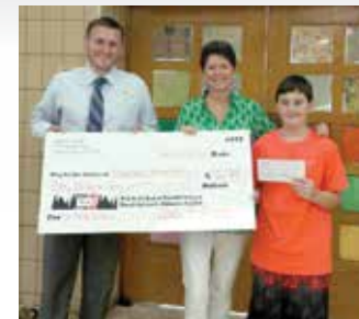
3rd Place Madison Elementary School in Davenport